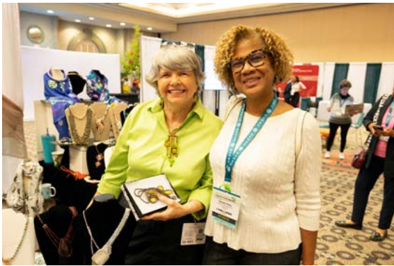
EXHIBIT HALL OPPORTUNITIES

The exhibit hall at NAWBO's Women's Business Conference in Austin, Texas, will be a major highlight of this year's conference experience. Hundreds of conference participants will stop in throughout their days to connect with a wide range of local, national and global exhibitors and their products and services, as well as with one another. It's a high-traffic, high-visibility set up that will no doubt increase your exposure and build your brand.